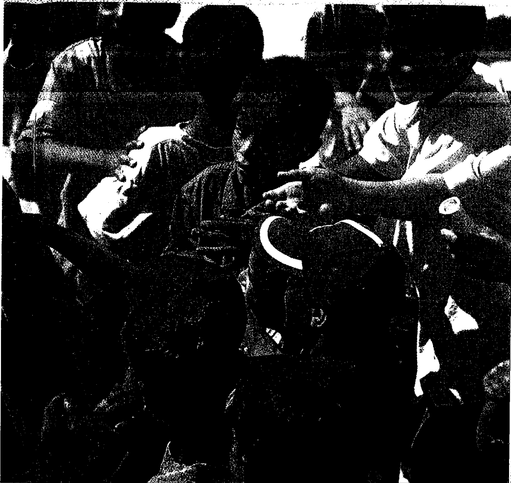
Welcome wagon: Iraqi children (as well as many of their parents) are eager to come out and meet and greet U.S. troops as they patrol the country.